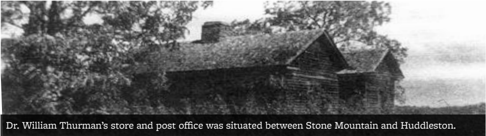
Dr. William Thurman’s store and post office was situated between Stone Mountain and Huddleston.

* A sample collected in October 2022 indicated the sodium in the treated water is 79.4 mg/L. This is above the EPA recommended optimal level of less than 20 mg/L for sodium in drinking water, which is established for those individuals on a “strict” sodium intake diet.