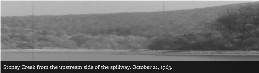
Stoney Creek from the upstream side of the spillway. October 21, 1963.

** During the past year, we were required to conduct one Level 1 assessment for our waterworks, due to the presence of total coliform bacteria in two bacteriological samples collected in June 2023 monitoring period. There was one corrective action. The corrective action and the level one assessment were both completed in 2023 for our water system.