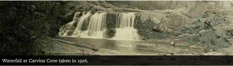
Waterfall at Carvins Cove taken in 1926.

Data presented as (range) Average. PWSID# 5019795